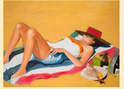
5 CHRISTINA L DESSER * Oil Painting 45 Knob Hill Road Point Reyes Station CA [415] 314-0212 chrisdesser.com