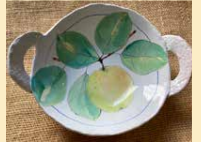
10 LAURIE CURTIS Watercolors & Clay 11030A Hwy 1 (behind Vet) Point Reyes Station CA [415] 663-8724 lauriecurtis.net