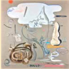
7 ALICE GOULD Oil on Linen Cowgirl Creamery, #209 Point Reyes Station CA alicegouldportfolio.com