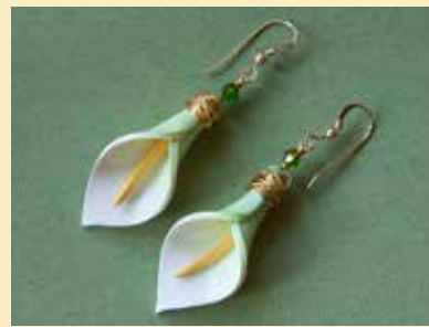
4 KATHY HUNTING Polymer Clay & Beaded Jewelry 11 Ridge View Lane Point Reyes Station CA [415] 873-6009 earlybirdbeads.com