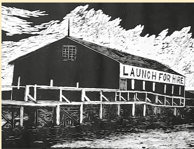
6 SIRIMA SATAMAN * Printmaking 11401 Highway 1 (at gas station) Point Reyes Station CA sirimasataman.com