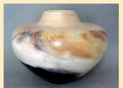
20 MOLLY PRIER Pottery & Pueblo Style Vessels 41 Cameron Street Inverness CA [415] 669-7337 carolmollyprier.com