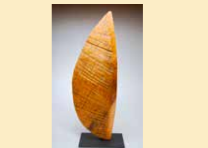
15 BRUCE MITCHELL Wood Sculpture 11 Sherwood Road Inverness CA [415] 847-1145 bruceMITCHELLstudios.com