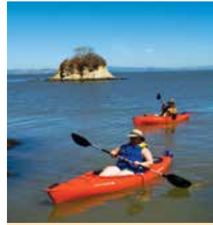
Kayaking near Rat Rock

Programs and Events —Campfire programs are held for campers from May to October. Junior Ranger programs are held by request. Heritage Day celebrates Chinese culture with activities, tours, and exhibits. The schedule is available at www.parks.ca.gov/chinacamp . School and other groups should call (415) 456-0766 in advance to arrange visits.